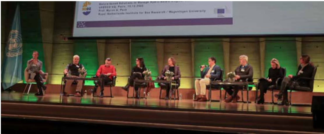
Figure 11: Panel speakers of Roundtable on Nature-based solutions in EU: Challenges and lessons learnt.