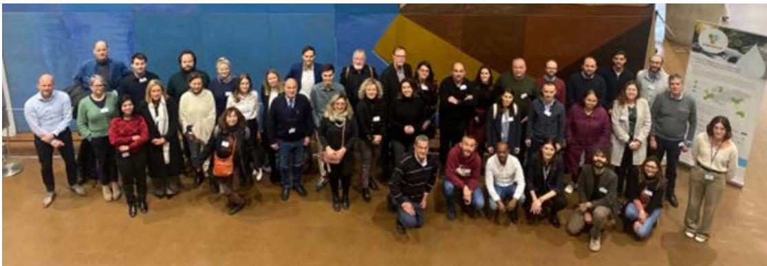
Figure 7: Photo of OPERANDUM partners during the final conference at UNESCO HQ.

In the final stage of the OPERANDUM project a final conference was held at UNESCO Headquarters in Paris. UNESCO led the organisation of the Final Conference while content preparation for conference sessions was co-led by UNESCO, UNIBO (OPERANDUM coordinator) and NGI (Norwegian Geotechnical Institute, PHUSICOS coordinator). Several brainstorming calls were held from July 2022 onwards between UNESCO, UNIBO and several partners to come up with the most suitable formats to address the aims of each session (see Table 1).