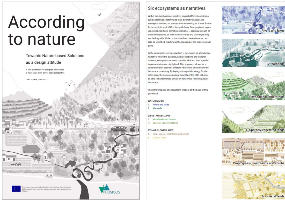
Figure 4: Front page and illustration of the six ecosystems as narratives in the NBS Guidebook "According to nature – towards Nature-based Solutions as a design attitude" (PHUSICOS D8.7 with contributions from OPERANDUM and UrbanGreenUP).

In this work, the OPERANDUM team has also been working on analysing NBS cases already included in the GeoIKP platform. This extra effort made by the OPERANDUM and PHUSICOS is allowing to further harmonize the results of each project and identify clarify the methodology for the clustering of NBS as well as facilitate the uptake.