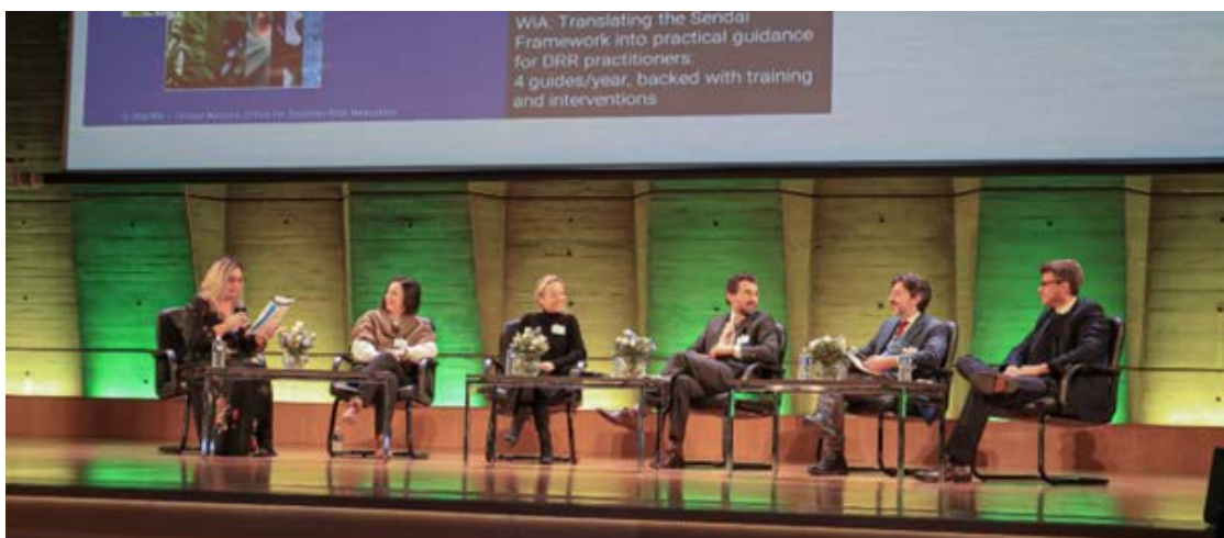
Figure 10: Panel speakers of roundtable on Nature-based solutions in the EU environmental agenda.

The first session on “Nature-based solutions in the EU environmental agenda - Science & policy gaps and challenges of NBS implementation in Europe” was moderated by OPERANDUM and addressed relations between the Global and EU agenda and research gaps for NBS. The panel included representatives from the European Commission’s Directorate-General for Research & Innovation, the IUCN, the United Nations Office for Disaster Risk Reduction, Aqua Publica Europea and the UNESCO Regional Bureau for Science and Culture in Europe.