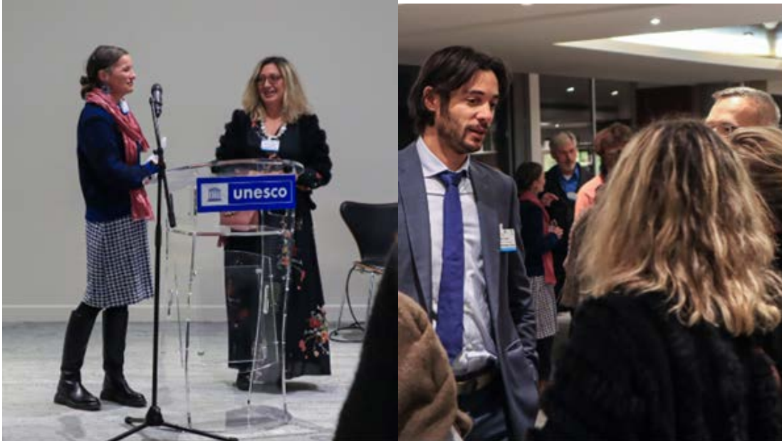
Figure 13: Welcome address by OPERANDUM and PHUSICOS coordinators (left), discussion between European Commission representative and EU project coordinators (right).