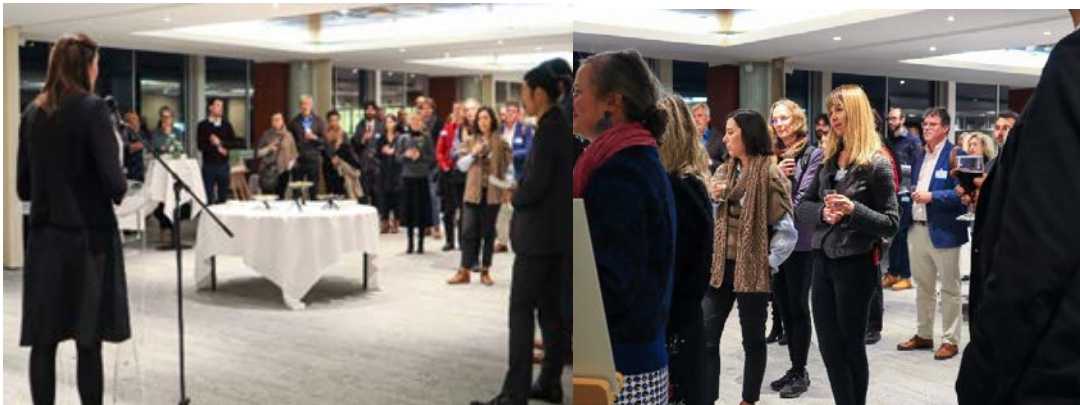
Figure 14: Welcome by UNESCO DRR project officer (left) and snapshot of final conference participants (right).