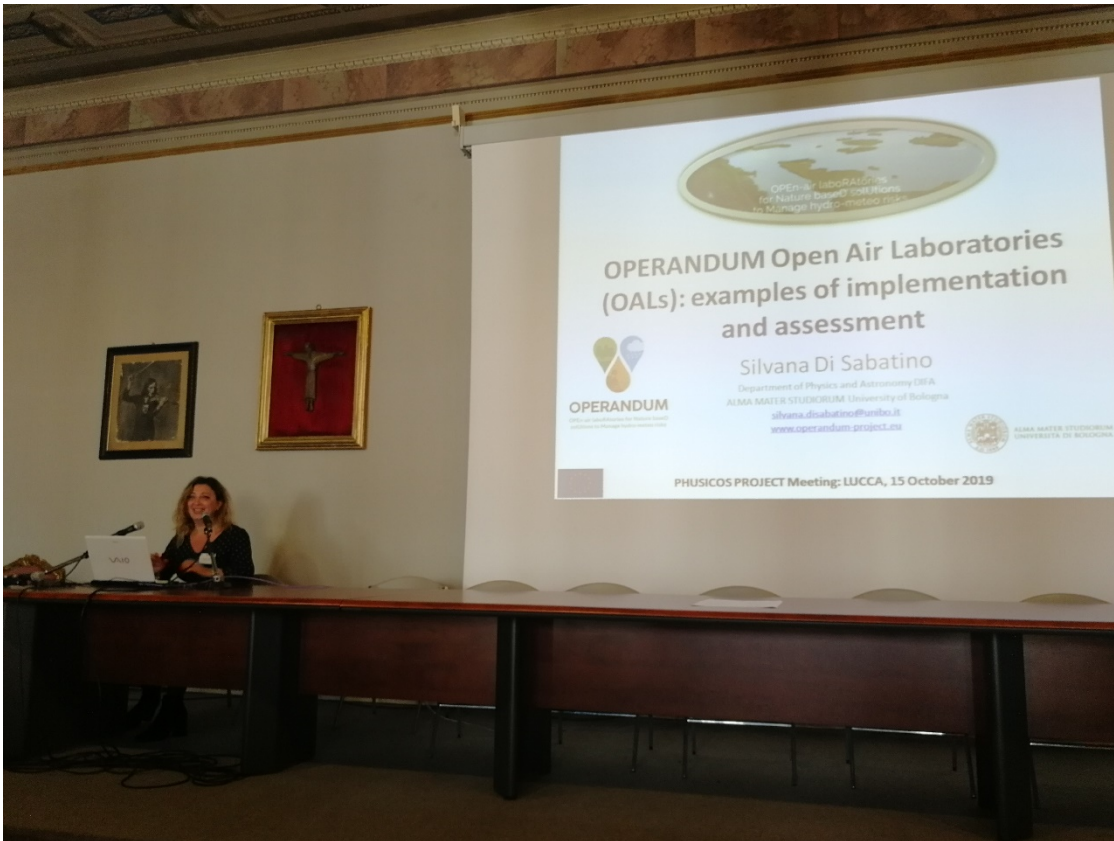
Figure 1: The coordinator of the OPERANDUM project at the PHUSICOS consortium meeting, Lucca, Italy in October 2019.