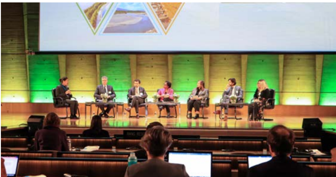
Figure 12: Panel members at Information meeting to UNESCO Member States.

The information session on “Advancing the disaster risk reduction and climate change adaptation agenda: application of ecosystem services and nature-based solutions” was moderated by UNESCO’s Disaster Risk Reduction Unit, to build evidence of the role of NBS in societal challenges and accelerate the environmental agenda. The panel included representatives from UNESCO’s Division of Ecological and Earth Sciences and Division of Water Sciences, the Universities of Glasgow and of Bologna, the United Nations Office for Disaster Risk Reduction, and the European Research Executive Agency.