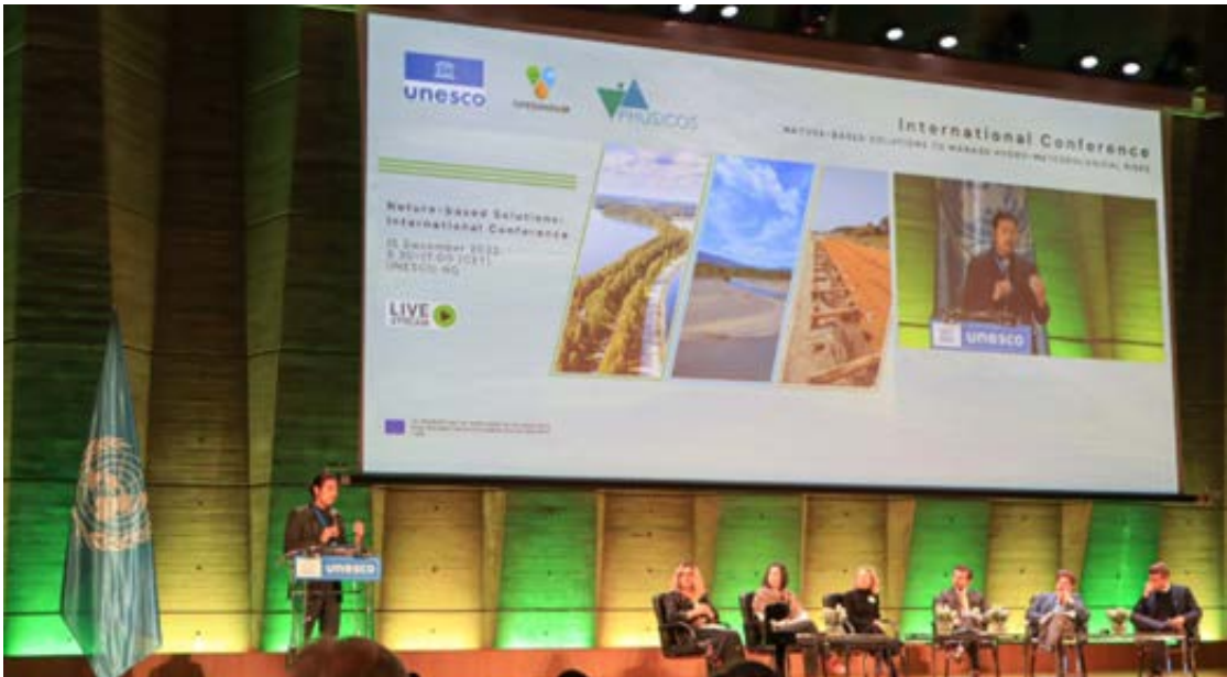
Figure 9: Welcome speech at international conference on NBS by UNESCO's chief of DRR unit.