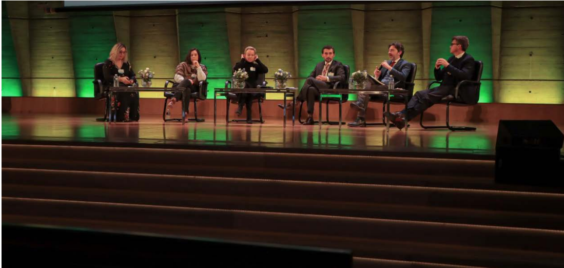
Figure 8: Panel discussion on the science and policy gaps and challenges of NBS implementation in Europe at UNESCO, Paris (photo: OPERANDUM).

were both physically present and via streaming. Details are provided in the following chapters and videos from this second day are available via YouTube ( OPERANDUM - YouTube ).